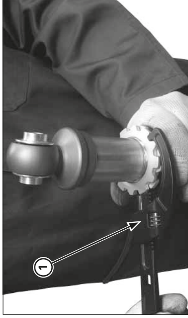
(1) SPANNER WRENCH