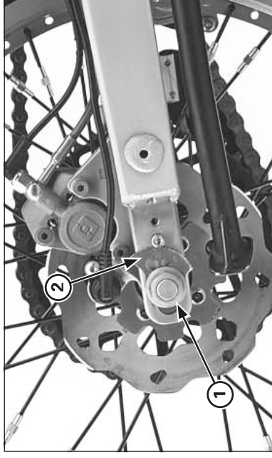
(1) AXLE NUT (2) ADJUSTER

Rotate the wheel and chain slack in several sections. If slack in one section increases beyond the standard measurement, this indicates the chain has stretched and needs to be replaced. Take care to prevent catching your fingers between the chain and sprocket.