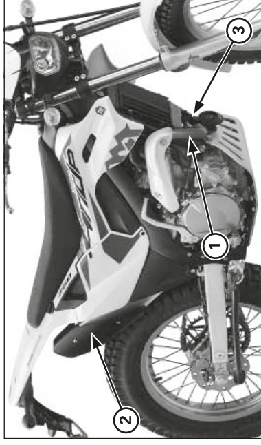
(1) EXHAUST PIPE (2) MUFFLER (3) LAMBDA-SONDE