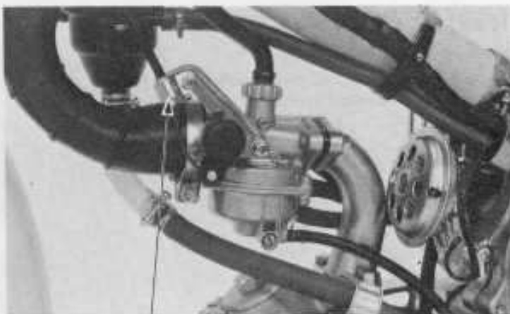
CHOKE CABLE CLAMP