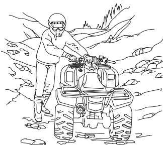
Be sure your legs are clear of the wheels.

If the hill is not too steep and you have good footing, you may be able to walk the ATV back down the hill. Make sure your intended path is clear in case you lose control of the ATV.