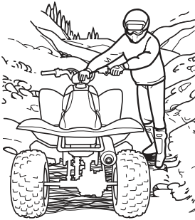
Be sure your legs are clear of the wheels.

If the hill is not too steep and you have good footing, you may be able to walk the ATV back down the hill. Make sure your intended path is clear in case you lose control of the ATV.