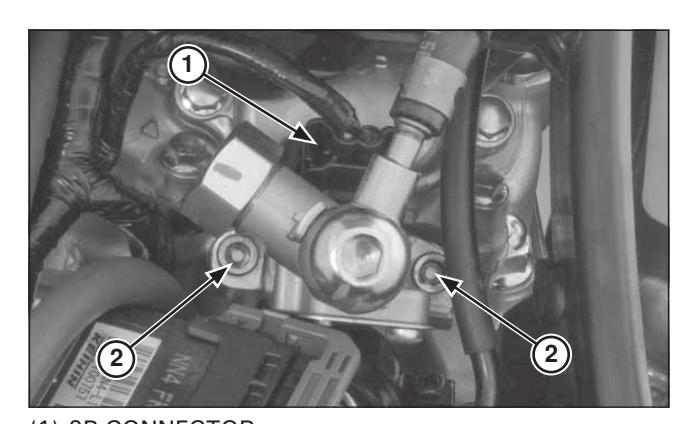
(1) 2P CONNECTOR (2) SOCKET BOLTS