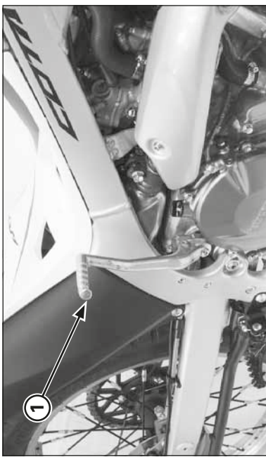
(1) KICKSTARTER PEDAL

When filling the coolant system, be sure to bleed air completely. If not, the system cannot be sufficiently filled and will cause overheating.