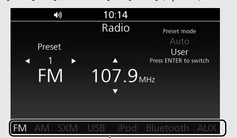
____ Information bar

Press \frac{\text{COURCE}}{\text{d}^{\chi}} switch to change the audio mode. Cycles through the audio modes on the information bar as follows: [FM] \rightarrow [AM] \rightarrow [SXM] (option) \rightarrow [USB] \rightarrow [iPod] \rightarrow [Bluetooth] \rightarrow [AUX] (option)