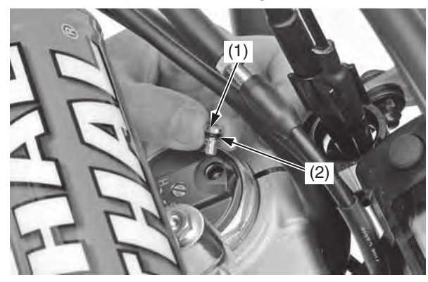
(1) pressure release screw

4. Install and tighten the pressure release screw to the specified torque:1.0 lbf·ft (1.3 N·m, 0.1 kgf·m)