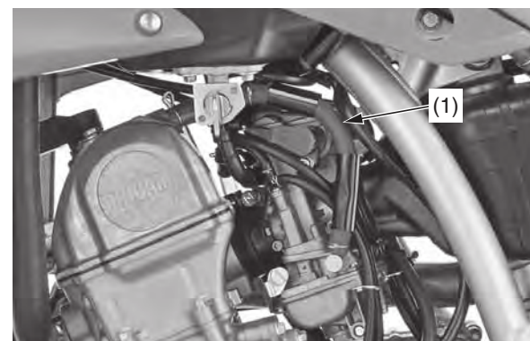
(1) fuel line