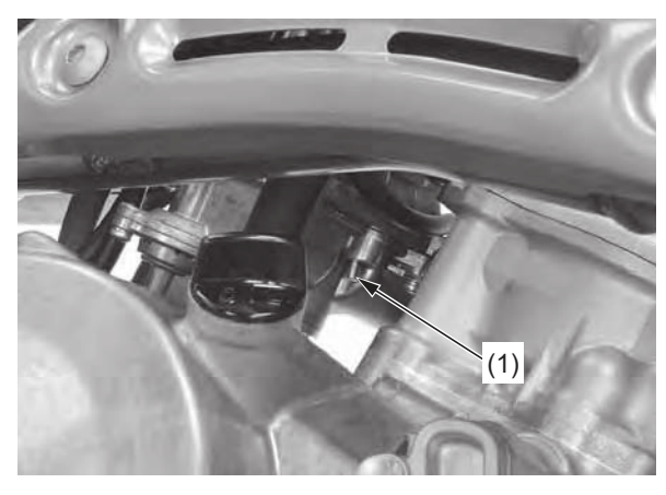
(1) pilot screw

The minimum to maximum range of pilot screw adjustments is 1 1/2 to 2 1/4 turns out from the lightly seated position. If you exceed 2 1/4 turns out, the next larger slow jet is needed. If you are under 1 1/2 turn out, the next smaller slow jet is needed.