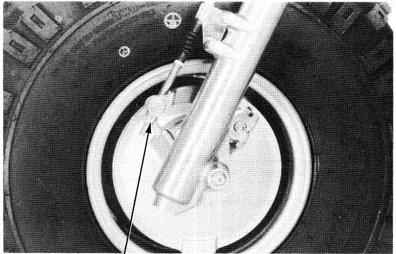
FRONT BRAKE ADJUSTING NUT

Remove the front brake adjusting nut and disconnect the front brake cable.