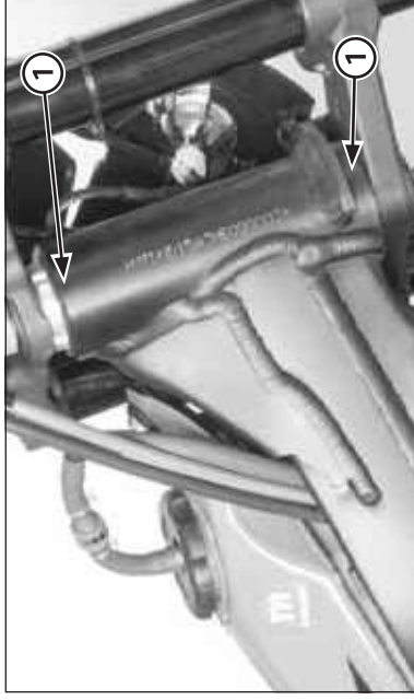
(1) STEERING HEAD BEARINGS