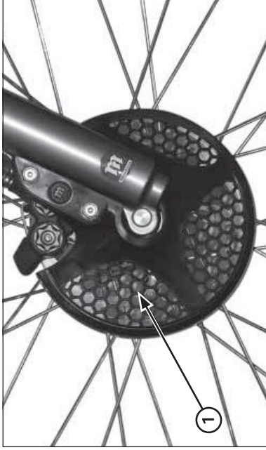
(1) BRAKE DISC

If either pad is worn, both pads must be replaced.