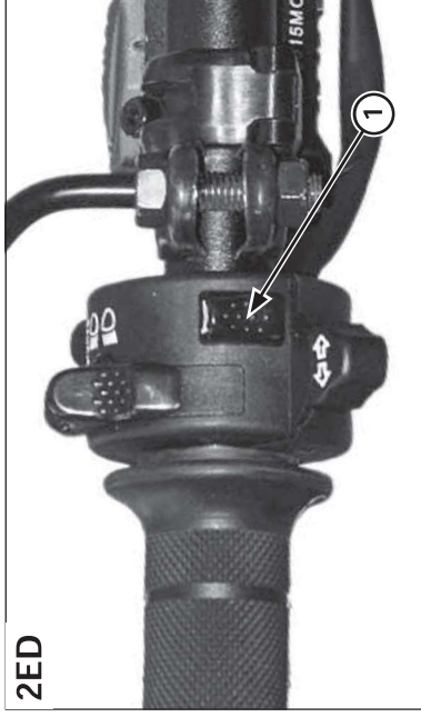
(1) HORN BUTTON