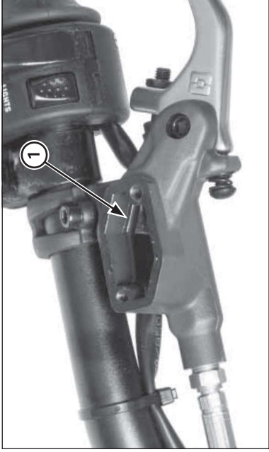
(1) UPPER LEVEL LINE

Lower the side stand to support your Cota. Always choose a level surface to park.