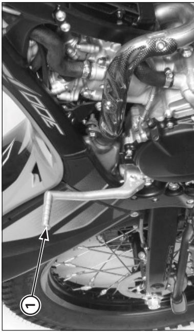
(1) KICKSTARTER PEDAL

When filling the coolant system, be sure to bleed air completely. If not, the system cannot be sufficiently filled and will cause overheating.