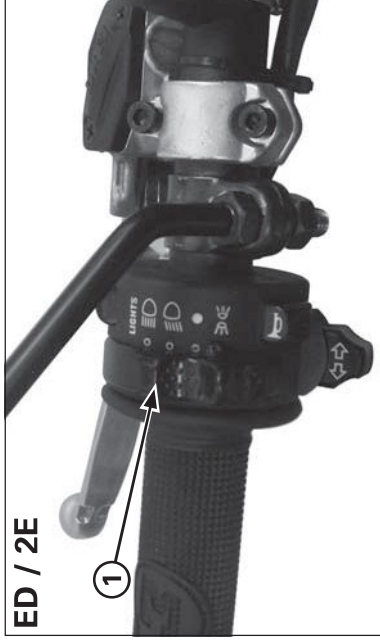
(1) HEADLIGHT DIMMER SWITCH (2) PASSING LIGHT CONTROL SWITCH