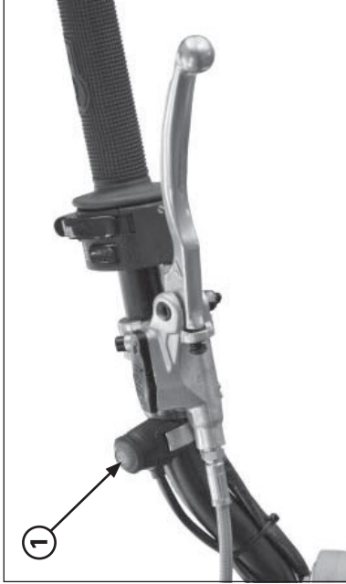
(1) ENGINE STOP BUTTON

When you shift the transmission into gear, apply front brake to prevent the motorcycle move forward.