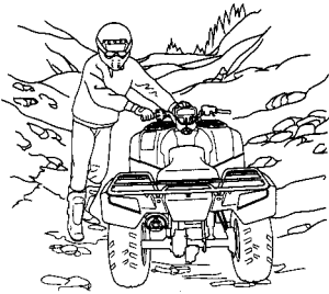
Be sure your legs are clear of the wheels.

If the hill is not too steep and you have good footing, you may be able to walk the ATV back down the hill. Make sure your intended path is clear in case you lose control of the ATV.