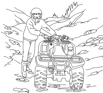
Be sure your legs are clear of the wheels.

If the hill is not too steep and you have good footing, you may be able to walk the ATV back down the hill. Make sure your intended path is clear in case you lose control of the ATV.