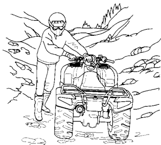
Be sure your legs are clear of the wheels.

If the hill is not too steep and you have good footing, you may be able to walk the ATV back down the hill. Make sure your intended path is clear in case you lose control of the ATV.