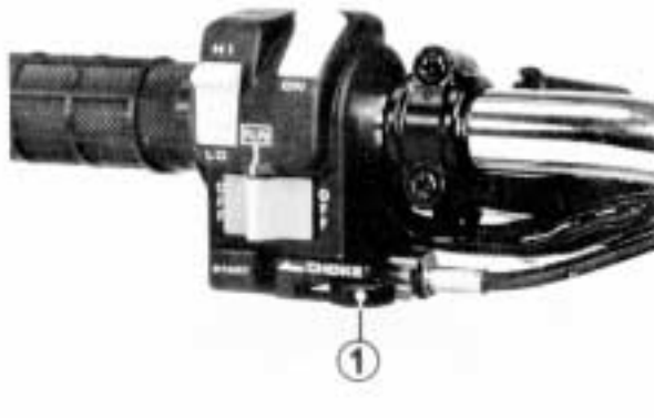
(1) Choke lever

The choke lever (1) is next to the left handlebar grip. Move the choke lever while pushing it to the left for starting the engine when cold. Move the lever while pushing it to the right as the engine attains normal operating temperature. To restart a warm engine, it is not necessary to use the choke.