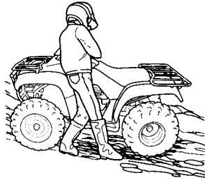
Body position for backing down a hill.