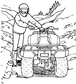
Be sure your legs are clear of the wheels.

If the hill is not too steep and you have good footing, you may be able to walk the ATV back down the hill. Make sure your intended path is clear in case you lose control of the ATV.