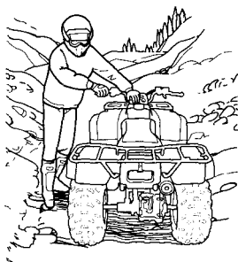
Be sure your legs are clear of the wheels.

If the hill is not too steep and you have good footing, you may be able to walk the ATV back down the hill. Make sure your intended path is clear in case you lose control of the ATV.