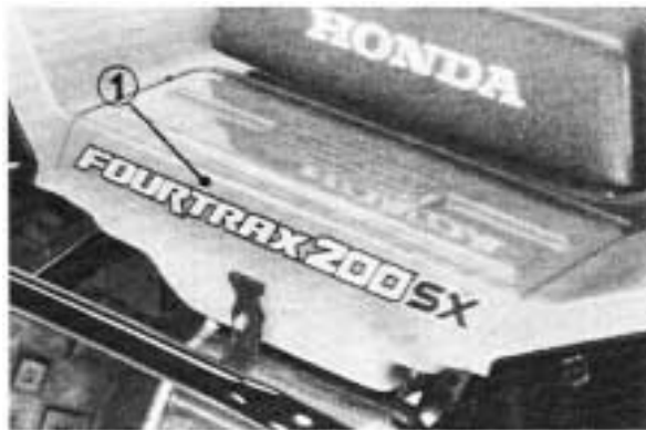
(1) Storage compartment