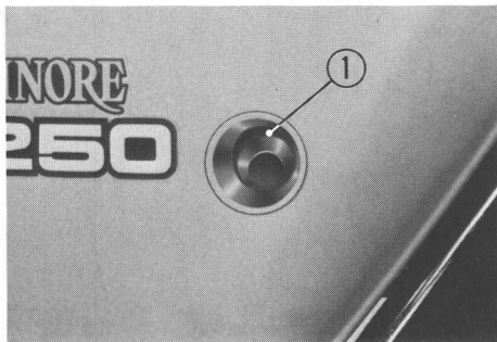
① Inspection window

The oil tank is located to the left center of the motorcycle. Place the motorcycle in an upright position, and check the oil level through the inspection window ①. When it is below the top of the inspection window, fill the tank with oil (see engine oil recommendations, page 9).