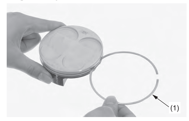
(1) removed piston ring

1. Remove the carbon deposits from the piston head and piston ring grooves with the removed piston ring (1).