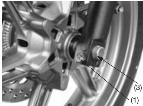
(3) Front axle