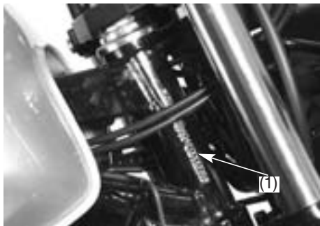
(1) Frame number

The frame number (1) is stamped on the right side of the steering head.