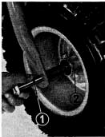
① Front Axle ② Wheel Hub

WARNING BE CERTAIN THAT THE AXLE NUT IS TIGHTENED AND SECURED BY A COTTER PIN. IF IT IS NOT, THE WHEEL MAY COME LOOSE DURING OPERATION.