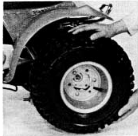
① Wheel nuts