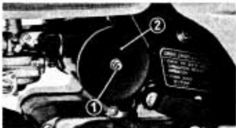
① Bolt ② Air cleaner cover

Never use gasoline or low flash point solvents for cleaning the air cleaner element. A fire or explosion could result.