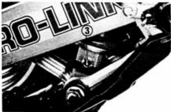
(3) Rebound damping adjuster

To adjust, turn the rebound damping adjuster (3) to the desired position, and test ride to see if adjustment is necessary. See page 22.