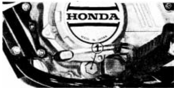
(1) Drain plug