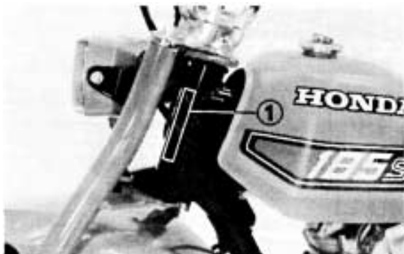
(1) Frame serial number

The frame serial number (1) is stamped on the left of the steering head. The engine serial number (2) is stamped on the crankcase just above the left foot peg.