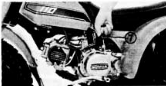
(7) Recoil starter rope