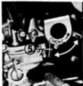
(5) Choke lever